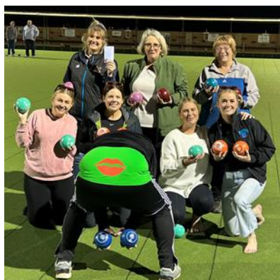
Twilight bowlers having fun!