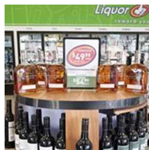
Bottle shop at the "V" in Virginia