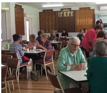
Library Day guests enjoy the afternoon tea

These events assist the club financially and show case our venue.