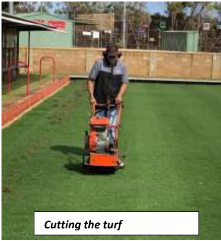
Cutting the turf