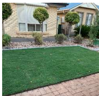
PAT WATERS NEW LAWN Planted with turf from A green