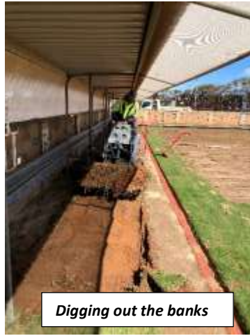
Digging out the banks